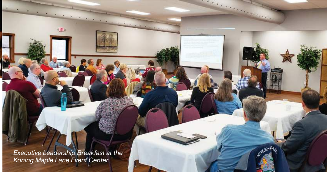
Executive Leadership Breakfast at the Koning Maple Lane Event Center

The Community Kitchen, based in Monticello, provides quality, nutritious, and accessible meals created through the transparent co-ownership of local farmers and workers. It uses a modified CSA-style food distribution network, in which members pay upfront for prepared meals and grocery items, including meat, cheese and bakery goods. Ninety percent of ingredients come from family farms within 150 miles of Monticello, and fresh vegetables, dairy, meat, eggs and small grains come from certified organic producers. The co-op's goal is to help build a more resilient food system through its culture of accessibility, fair wages, transparency and year-round distribution.