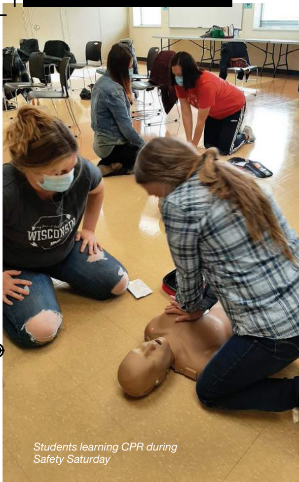
Students learning CPR during Safety Saturday