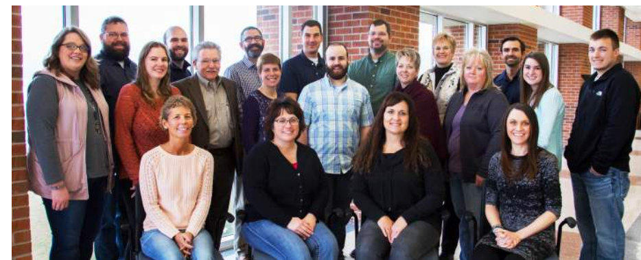
Green County Leaders Class of 2018-19