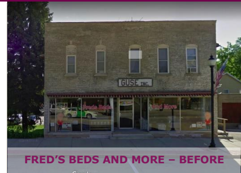
FRED'S BEDS AND MORE – BEFORE