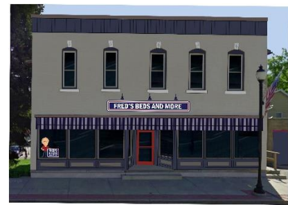
FRED'S BEDS AND MORE – FAÇADE RENDERING