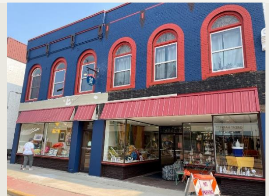
ART ON THE TOWN - AFTER