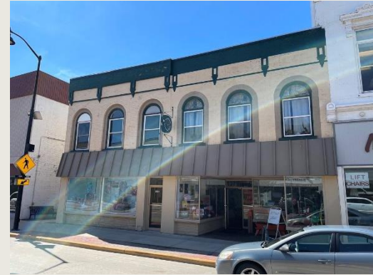
ART ON THE TOWN - BEFORE