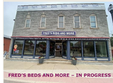
FRED'S BEDS AND MORE – IN PROGRESS