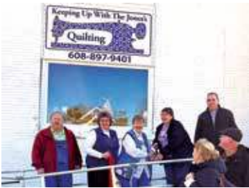
Brodhead Quilt Shop Ribbon Cutting