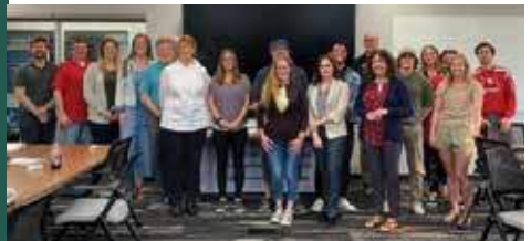
Small Business Series 2023 Class

From solidifying a business plan to focused finance and marketing, and a chance to pitch their business, Green County entrepreneurs got a head start making their dreams a reality.