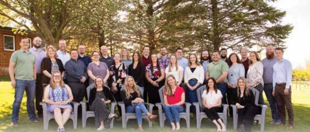
2022/2023 Green County Leaders (32 participants)