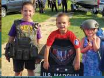
Belleville Night Out