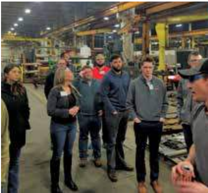
GCL at Monroe Truck

Breaking participation numbers two years in a row, the Green County Leaders program continues to create leaders that gain a deeper understanding of issues in our county, build new connections and complete projects that benefit our area.