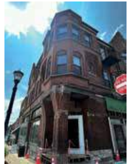
White Building historic preservation - Monroe