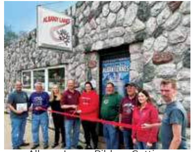
Albany Lanes Ribbon Cutting