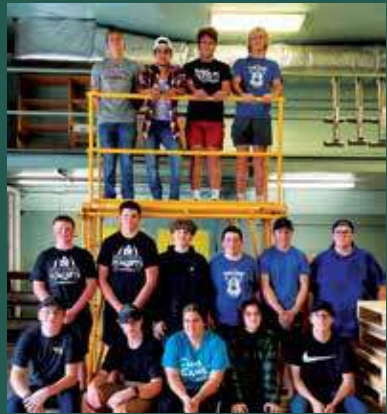
Monroe High School Launch student

GREEN ▶ COUNTY ▶ WI GCDC DEVELOPMENT CORPORATION 608-328-9452