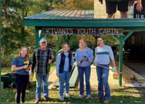
United Way Week of Giving