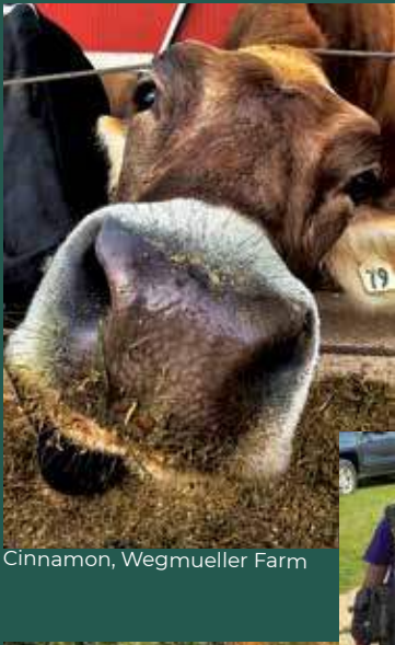
Cinnamon, Wegmueller Farm