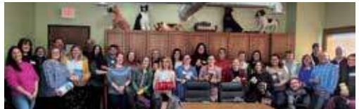
2023/2024 Green County Leaders