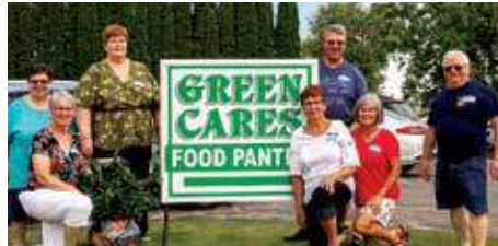
Monticello Green Cares Food Pantry