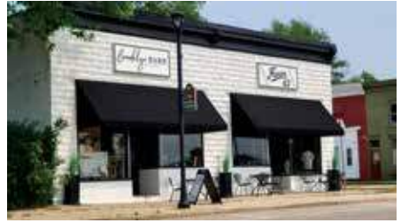
Brooklyn Barn and Farm 42