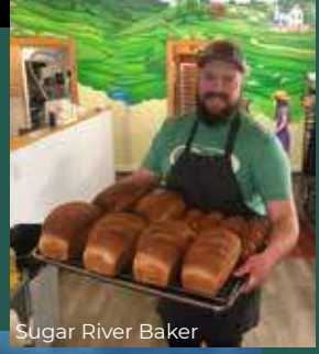
Sugar River Baker