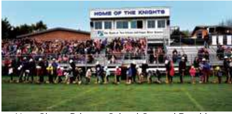
New Glarus Primary School Ground Breaking