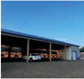
Monticello School Bus Barn