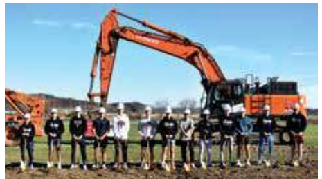
New Glarus Athletics Complex Ground Breaking