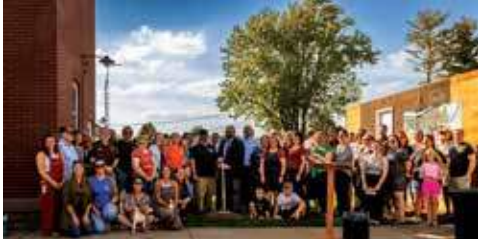
Green County Child Advocacy Center