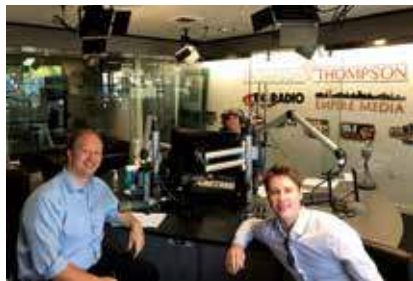
GCL at Big Radio