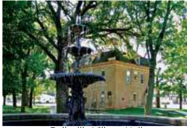
Belleville Village Hall