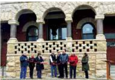
Monroe Historic Court House Ribbon Cutting