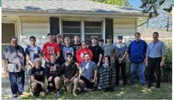
Monroe High School Launch students and instructors